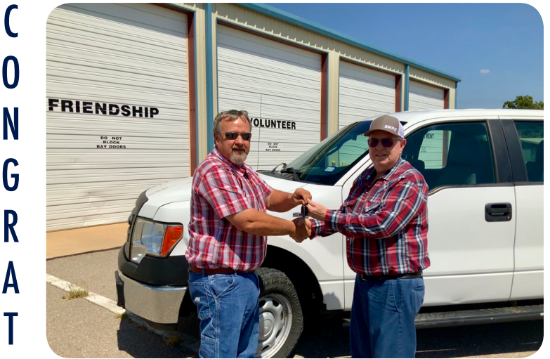
Pictured: SWRE delivered the keys to the grand prize truck to the Friendship Volunteer Fire Department!