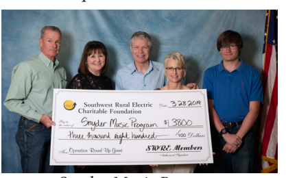
Snyder Music Program